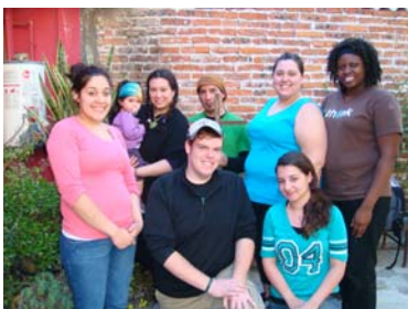
Volunteers from Lewis University

Students from Lewis University have been volunteering at Casa de los Angeles since 2001. For the first time this year the participants were able to receive college credit for their time with us in the workshop, Christian Service and Society: A Mexican Encounter . This is what the students have to say: